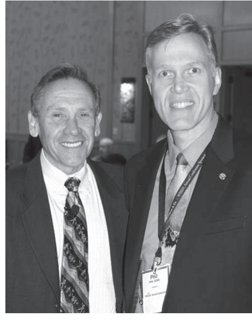
Additional photos from the conference are posted at www.flickr.com/wssda