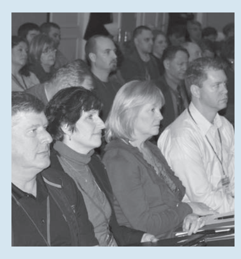
School directors focus on the issues at last year's conference.