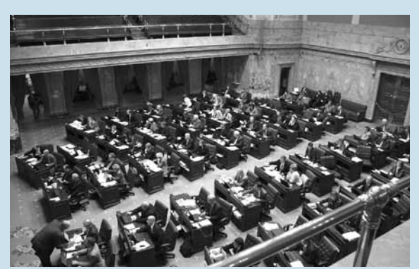
State Representatives working from the House floor during the closing days of the 2010 regular session.

Perhaps the most significant element of SB 6696 for school boards is a new K-12 accountability system in which